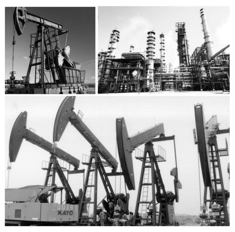
Fig. 1. Oil engineering site

redundant deployment way. Wireless sensor networks naturally show the high redundancy of temporal spatial sampling. Sampling redundant attributes can reduce the data flow in the network, which can reduce the energy consumption. The following picture is the scene of oil engineering.